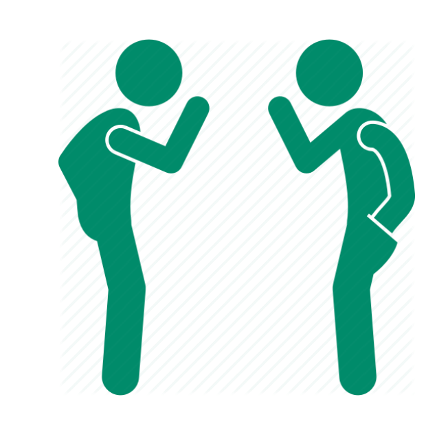
As - Salaam - Alaikum